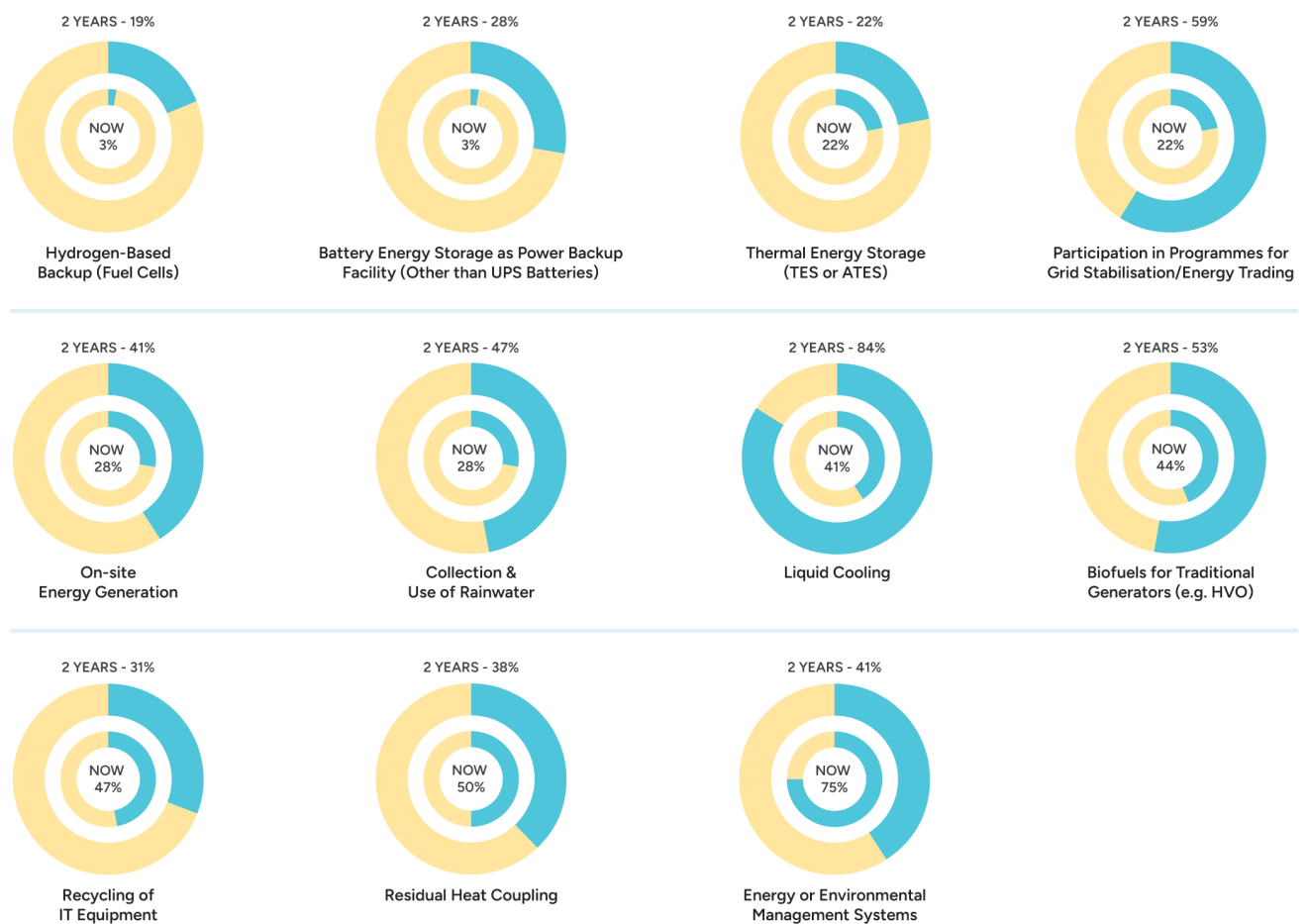
Figure 3. Current sustainability initiatives in operation; sustainable initiatives on agendas in the next two years